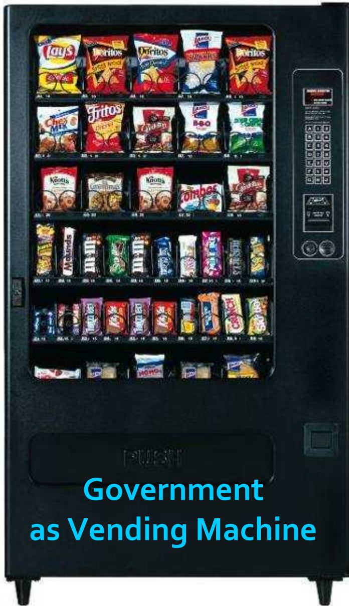
Government as Vending Machine