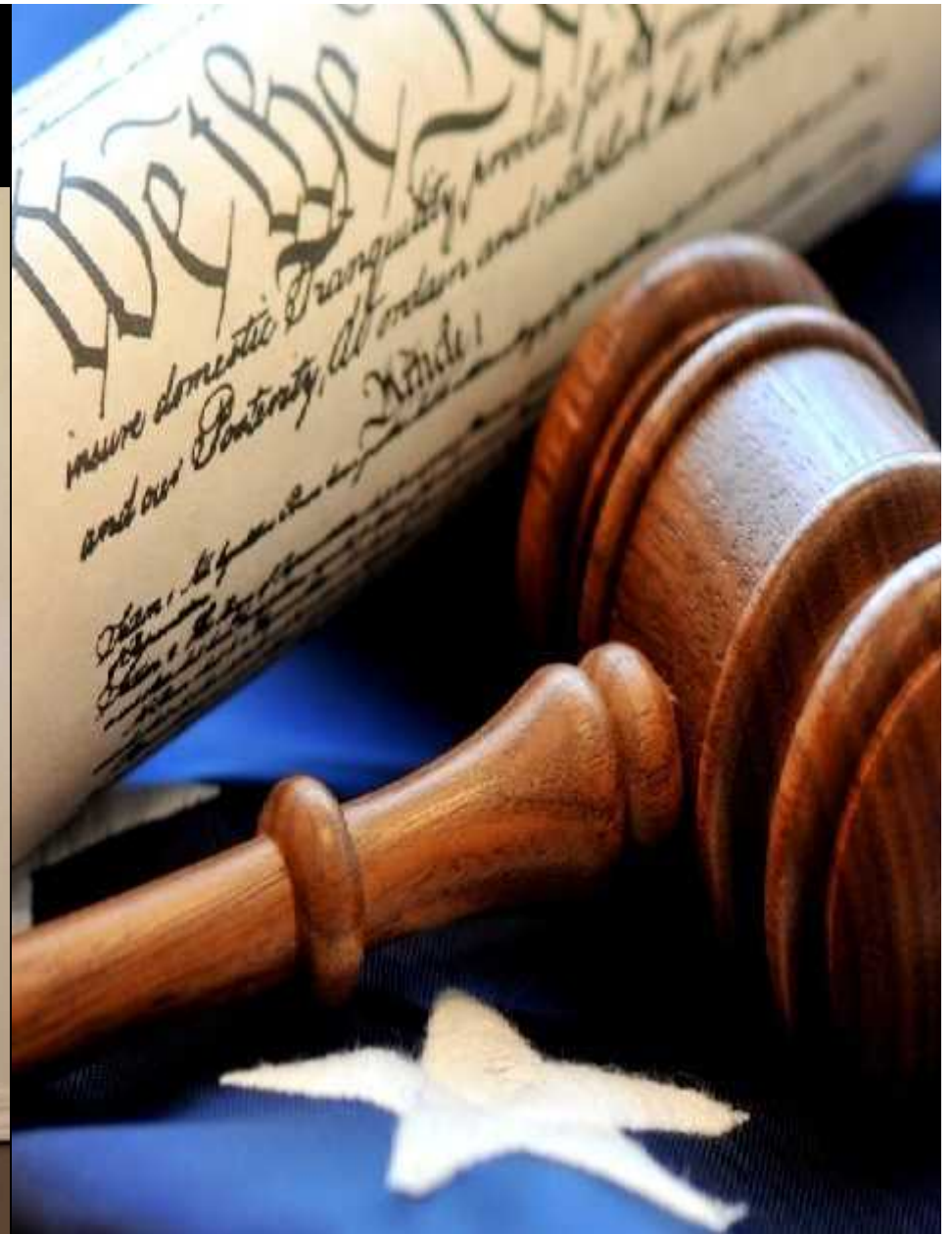
Mission and Purpose